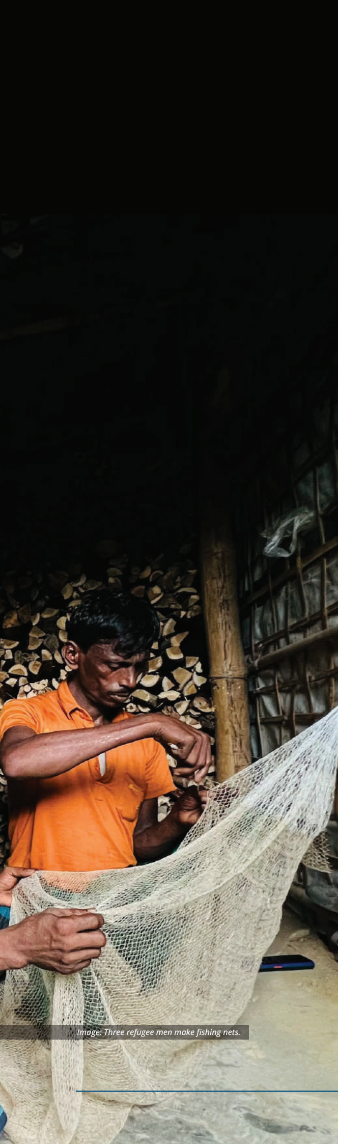
Image: Three refugee men make fishing nets.

Myanmar's civilian National Unity Government (NUG) formed in April 2021 in opposition to the new junta, and its representatives echoed the expressions of solidarity with Rohingya that had already emerged on the streets. Rohingya and the international community appreciated the NUG's tone but called for the appointment of a Rohingya representative to prove that its positive statements were genuine and not mere attempts to garner international support. 11 The NUG eventually appointed a Rohingya civil society leader from Myanmar as an advisor, but to date has not appointed a Rohingya representative. The gap between rhetoric and tangible progress fuelled scepticism among respondents, who pointed out that officials from the National League for Democracy, which held power during the 2017 exodus of Rohingya, are now in senior positions with the NUG. Still, they unanimously saw the NUG as their best hope: