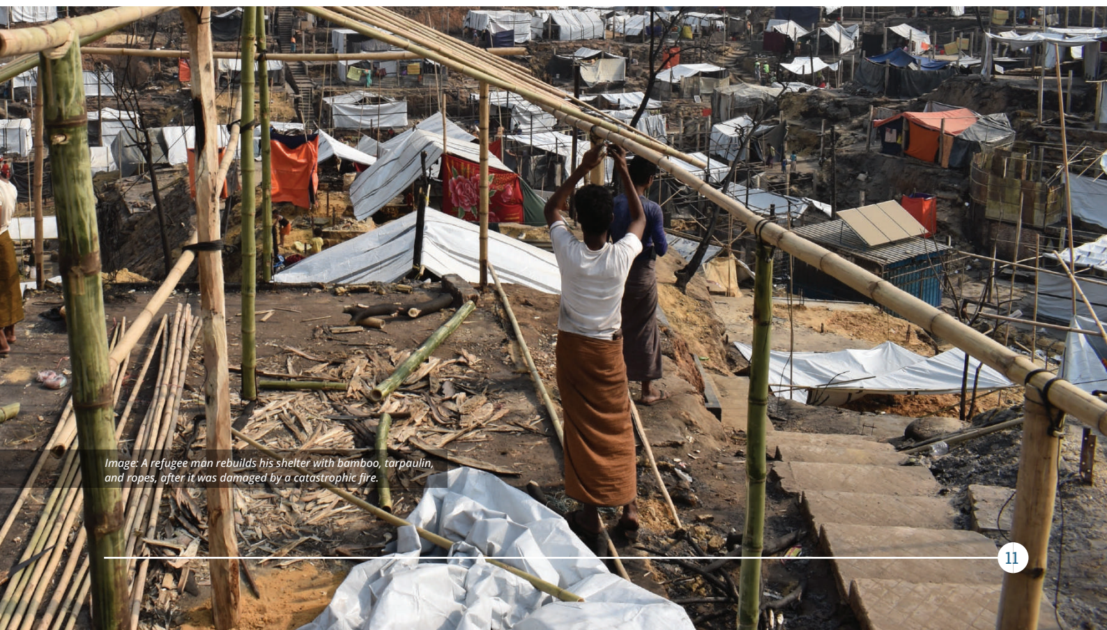
Image: A refugee man rebuilds his shelter with bamboo, tarpaulin, and ropes, after it was damaged by a catastrophic fire.

Camp RLIs are loosely governed due to a lack of resources, paid staff, human resource limitations, and the restrictive environment of the camps. Restrictions can be seen to parallel challenges the Rohingya faced in Myanmar, where they were prohibited from developing a civil society and forming organisations. One group leader said that its members were strictly prohibited from direct involvement in political activities and