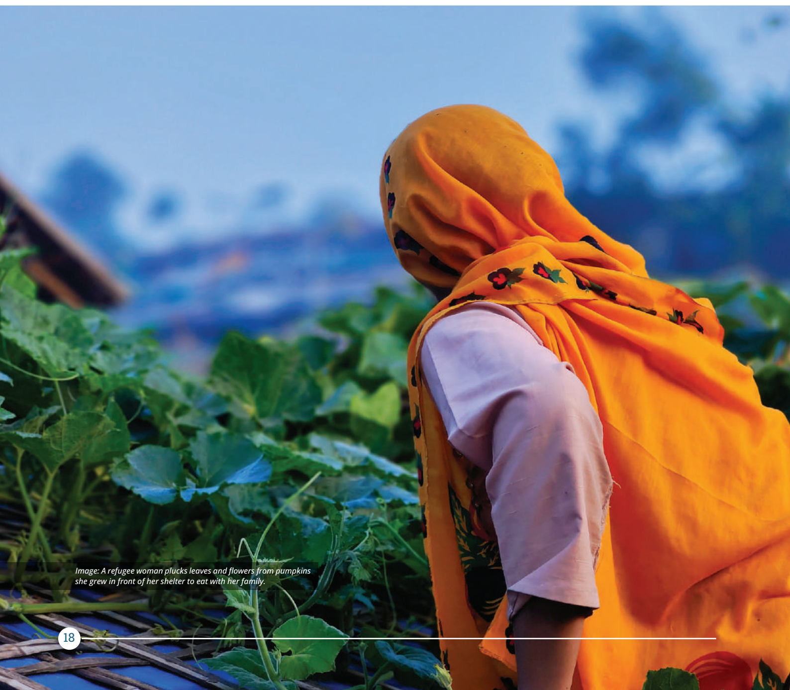
Image: A refugee woman plucks leaves and flowers from pumpkins she grew in front of her shelter to eat with her family.

In relation to women's issues, respondents noted that UN Women had developed relationships with the most prominent leaders of women's RLIs, and they had convened monthly meetings and engaged several women as volunteers who were paid a stipend to conduct community outreach activities. The RLI leaders who were involved in these activities seemed to feel more meaningfully engaged than those who engaged with other agencies. At the same time, there were points of dissatisfaction. Participants indicated that they were not always fairly compensated for their time or input when they engaged. Furthermore, respondents suggested that sometimes meetings felt extractive and that they received little in return for their work, despite providing a steady flow of essential information and insights that the agency needed. One woman felt that after consistent engagement for two years, 'we are becoming less trustful'. While there are restrictions by the Bangladesh government on work and compensation, compensation for time and work is a rights issue. Acknowledgement of the source of information is always important, as is feeding back to those who contributed so that they can see the impact. These are areas in need of improvement for all stakeholders.