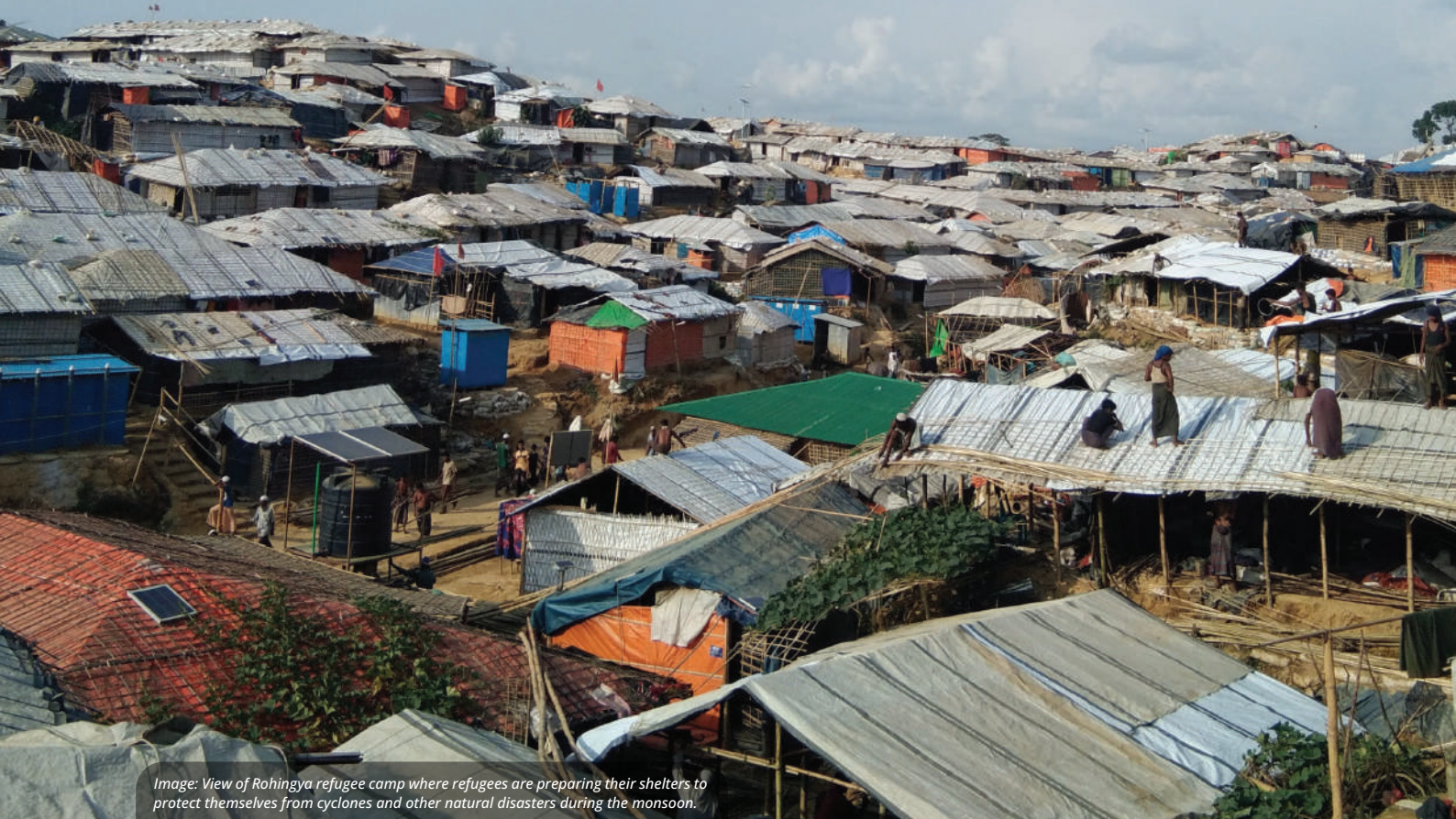
Image: View of Rohingya refugee camp where refugees are preparing their shelters to protect themselves from cyclones and other natural disasters during the monsoon.

The emergence and experiences of refugee-led initiatives (RLIs) in the Rohingya refugee camps of Cox's Bazar are not well documented. Although RLIs have been established in Cox's Bazar to bring attention to community demands and to provide a variety of protection and support services to refugees in the community, too little is known as to how these RLIs engage with their communities and other stakeholders, and what barriers they