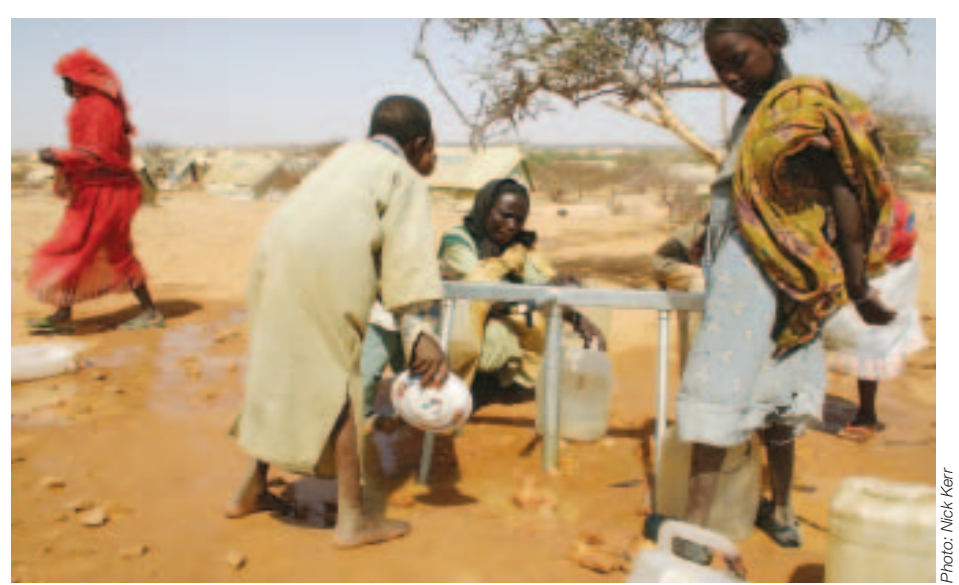
Refugees in Sudan gathering water for their daily needs