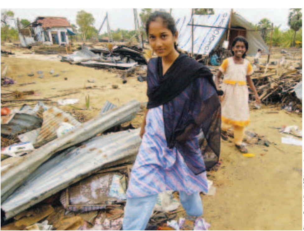
A woman steps amongst the ruins left behind by the Boxing Day Tsunami in Sri Lanka.

Support of Sudanese refugees living in the Kakuma refugee camp included food support, children's supplements and medicines. $33,731