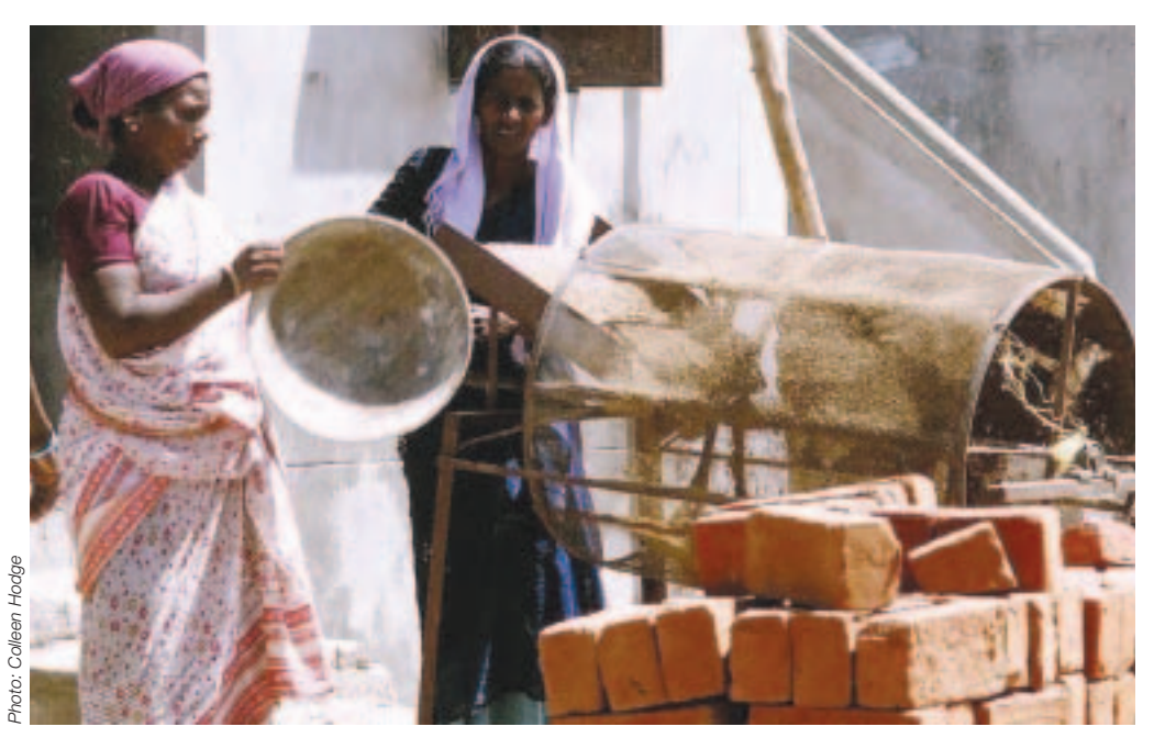
Dalit women in India making bricks.