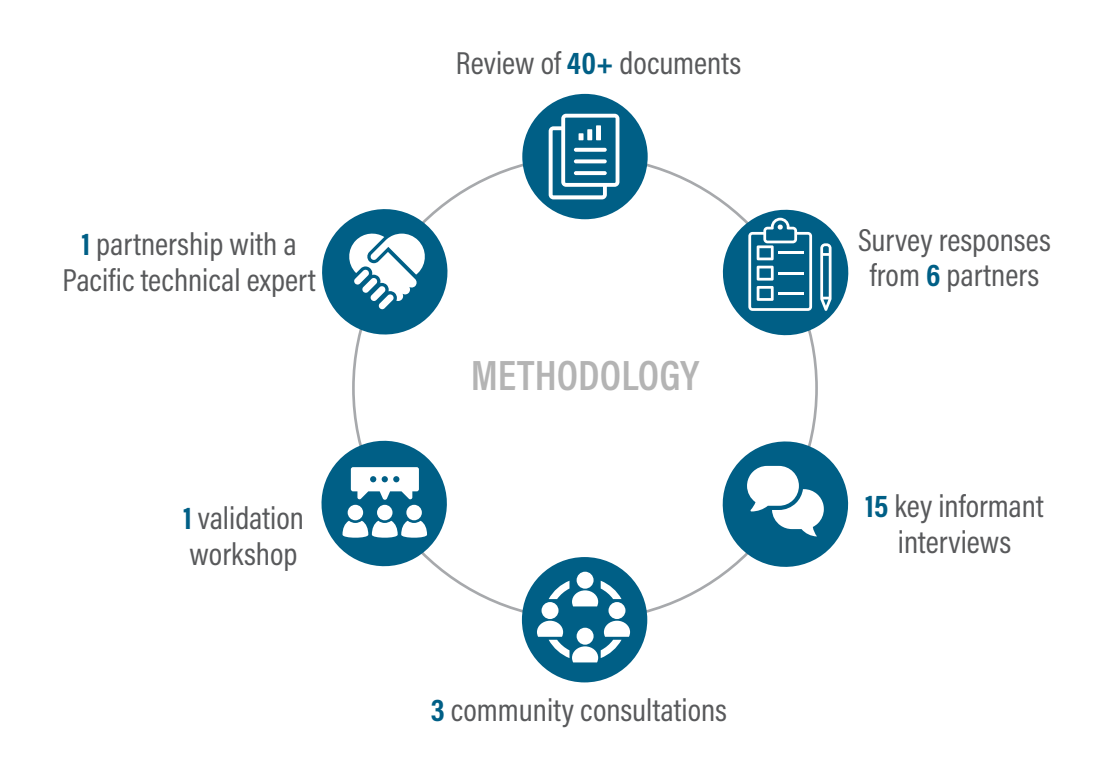
Figure 10: Methodology

A validation workshop with key internal stakeholders in AfP was used to test emerging themes and proposed priorities.