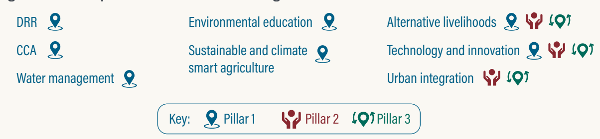
Figure 6: Partner priorities for technical training

Partners across different regions identified several technical trainings and areas for capacity development that they would prioritise and/or welcome AfP support. Broad categories are identified in Figure 6 below. This includes focus areas as they relate to climate and disaster displacement across the three pillars of this strategy. Additional consultation with partners will be required to understand needs and develop targeted training.