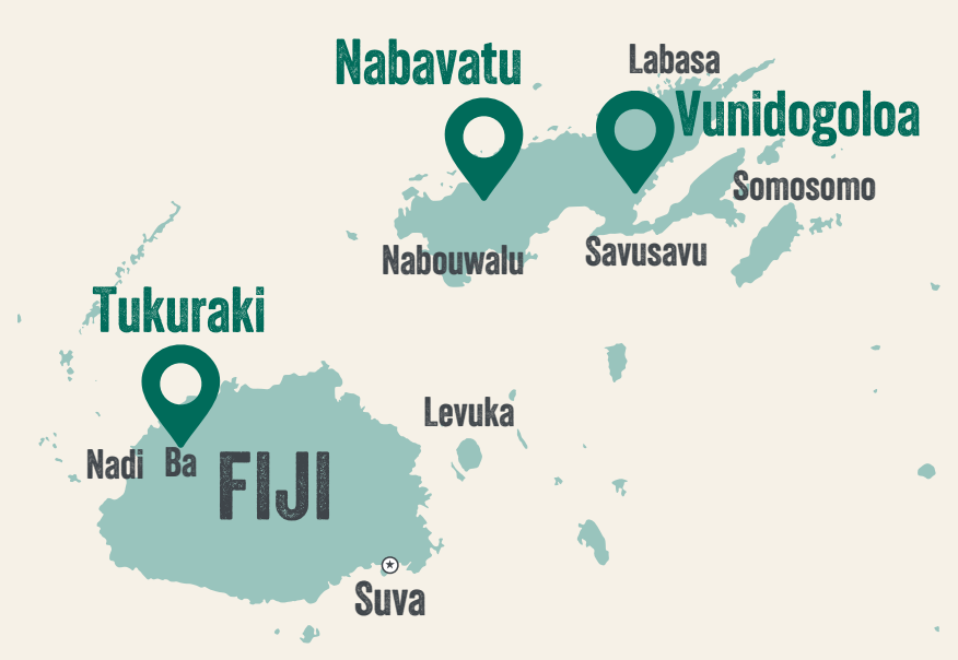
Figure 5: Map of consulted communities

The lived experience of displacement offers key insights into how AfP can develop ethical and rigorous approaches to programming, partnerships, policy development and advocacy. Engaging with displaced persons to listen and learn from their experience is also consistent with AfP's principled commitment to meaningful participation of refugees and displaced persons. We recognise displaced people have the right, capacity and desire to meaningfully participate and lead, and recognise initiatives are often more relevant and sustainable when displaced people are fully engaged. This strategy is informed by a series of consultations with three communities in Fiji – Nabavatu, Tukuraki and Vunidogoloa villages (see Figure 5) – which have been, or are in the process of being, relocated. These consultations were critical to the development of Pillar 3 of this strategy and represented the first steps in understanding community priorities and needs throughout relocation processes. Key findings are presented below. Building on these findings and continuing community consultation processes will be critical as AfP seeks to explore and pilot contextualised approaches to support communities, and have particular relevance for working in the Pacific.